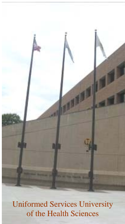
Uniformed Services University of the Health Sciences