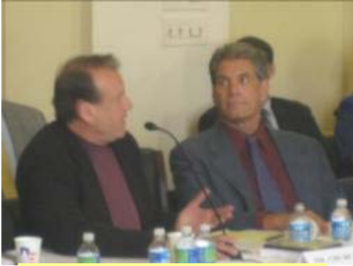
Dawson's Poignant Testimony