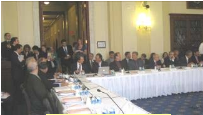
The Hearing about to begin