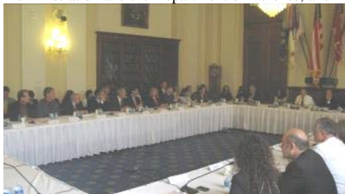
The Meeting Being Called to Order